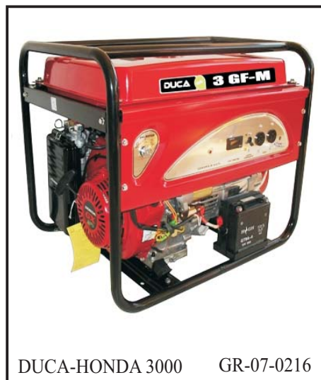
DUCA-HONDA 3000 GR-07-0216