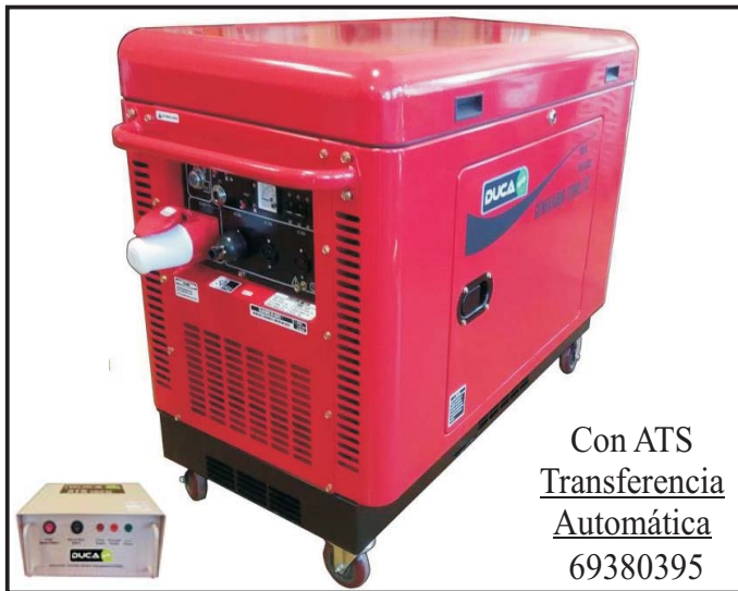
Con ATS Transferencia Automática 69380395