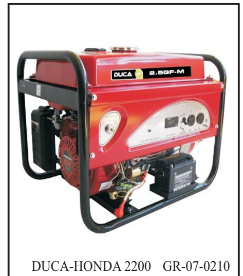
DUCA-HONDA 2200 GR-07-0210